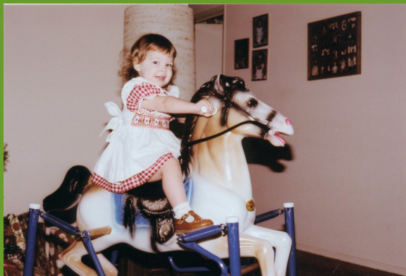
Me with Clip Clop, our spring horse

Favorite Horse Movie: The first one I fell in love with was "Wild Hearts Can't Be Broken," a movie about the high-diving horses of the Great Depression. It's definitely a testament to the courage and heart of the animals we love.