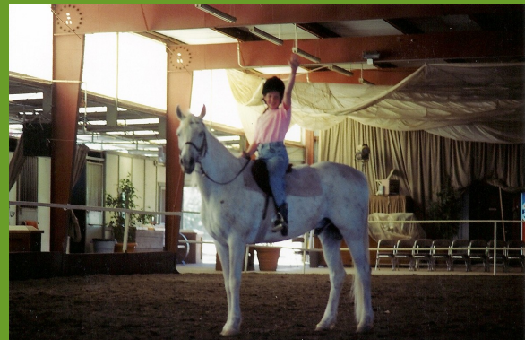
Riding Polska at Del Camino Arabian Ranch in Phoenix, where I rode for 2 years